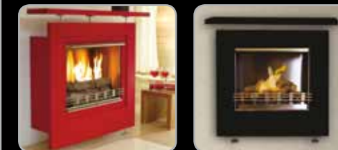
ignoRa® Model Metriek H.103 L.103 D.38cm. Weight. 50kg

This bio fireplace has an incredible light and stylist look. With its beautiful floating shelf it fits perfectly into the modern home. Model Metriek is made of MDF and steel. It can also be delivered with stainless steel insert and decoration wood.