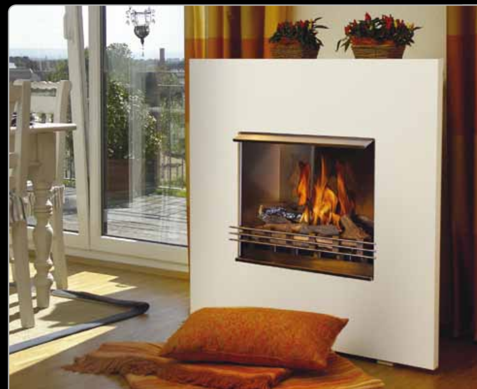
ignoRa® Model Karo H.103 L. 103 D.38cm. Weight. 50kg

Model Karo is a good choice of bio fireplace for your home. Its different shape makes it easy to place between two windows with its slimmer fit against the wall. This fireplace is made of MDF and steel. It can also be delivered with stainless steel insert and decoration wood.